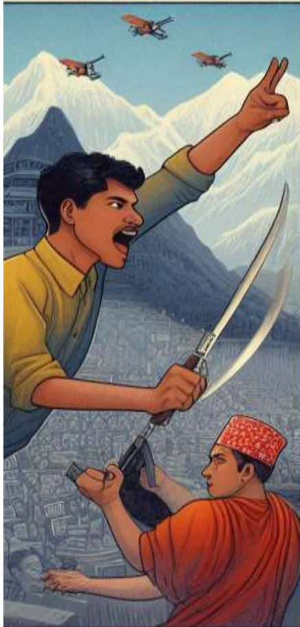
SOCIAL MOVEMENTS AGAINST DALIT-CASTE DISCRIMINATION

Improving Responses to Prevent Terrorism and Violent Extremism