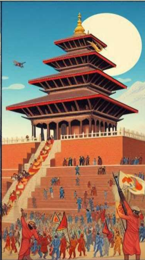
COMMUNISM/MAAL & COMMUNALISM